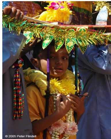
A young youth showing his priceless devotion.