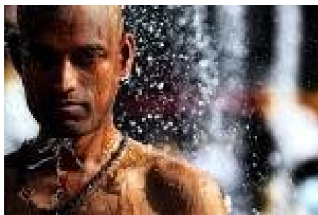
It's all about faith and perseverance.