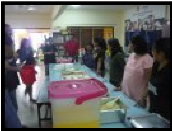
Volunteers at the dining area.

The children were grouped in with our youths for the games; they had such an enjoyable time and were very delighted to receive praises and approval from their elder team members. Everyone had a 'good' feeling in their hearts and many pictures were taken to capture the moment. From the success of this event, the NYW are highly motivated to organize another charitable event on a larger scale. The committee also wishes to extend its gratitude to all that have contributed to make this event a successful event.