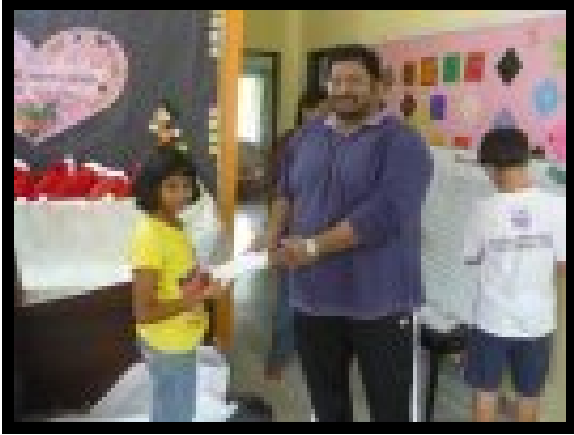
The NYW president giving away prizes.