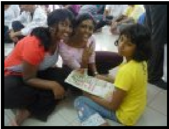
Volunteers and children having fun.