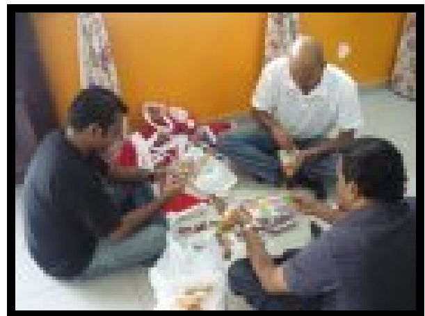
Volunteers helping to wrap presents.