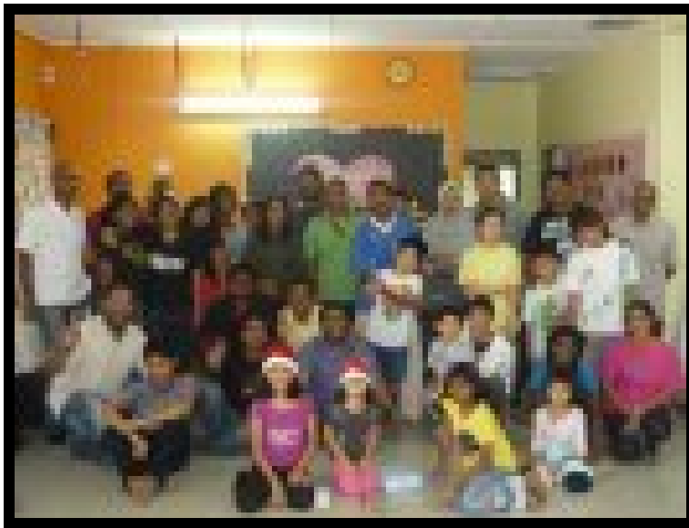
The Whole group!