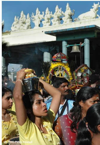
A pilgrim exudes serenity as she waits to climb the steps.

This wooden or bamboo structure called 'Kavadi' is covered with cloth and decorated with feathers of peacock - the vehicle of Lord Murugan. Generally, people take a vow to offer the Lord a Kavadi for the sake of tiding over a great calamity. The worldly object is achieved, no doubt, and the devotee takes the Kavadi; but after the ceremony, he gets so God-intoxicated that his inner spiritual being is awakened. In addition, this method ultimately leads to the supreme state of devotion.